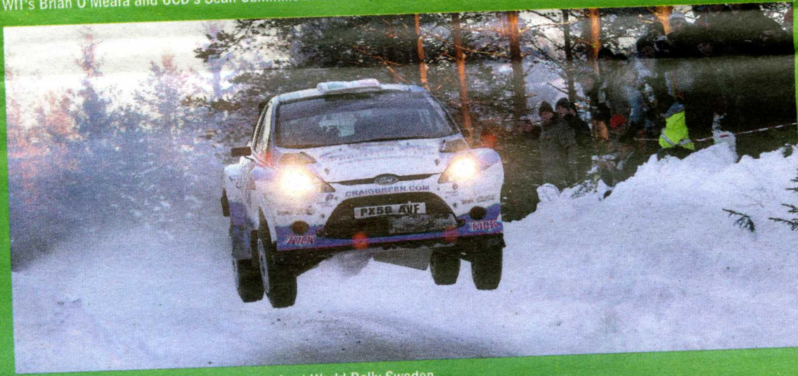
Craig Breen's flying Fiesta thrills the crowds at World Rally Sweden.