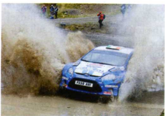
Breen tackles the stages at Rally GB